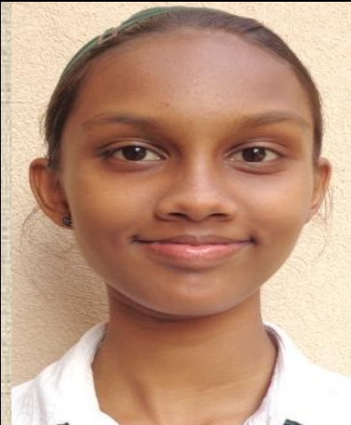
SWEKA R (97.4%)