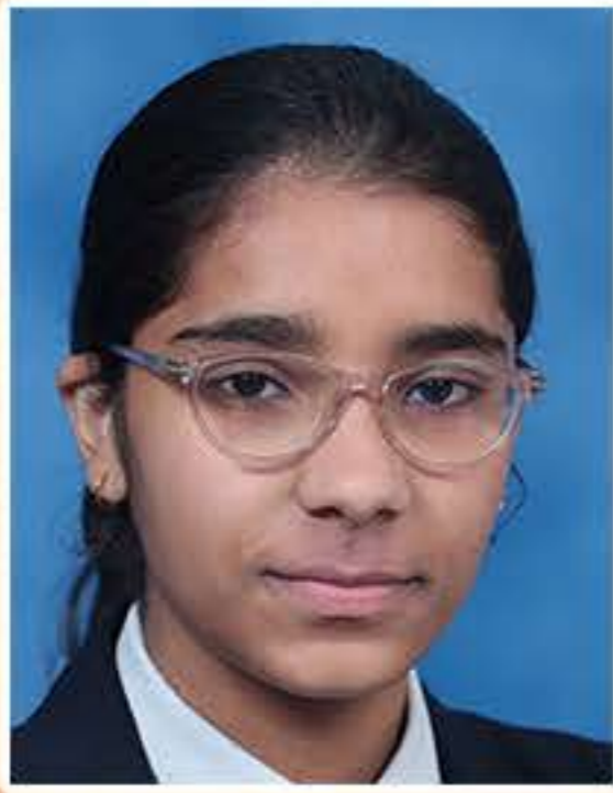
VANI IX Diamond