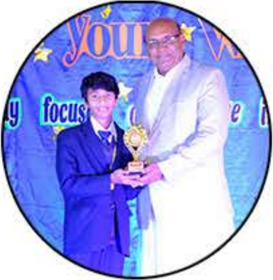
Aarav Gautam VII Diamond