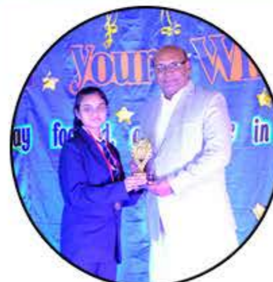
Nandini VIII Ruby