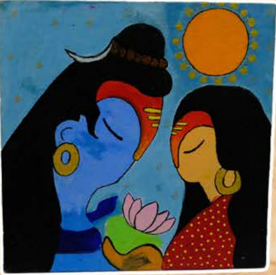
PRIYANSHU PANDEY VI Diamond