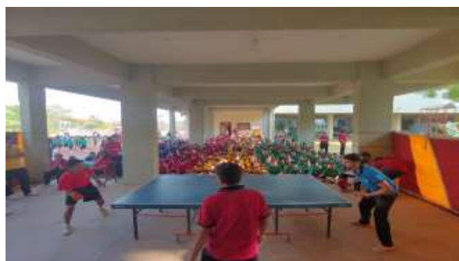
Senior Table Tennis Boys Dedication Senior Table Tennis Girls Integrity