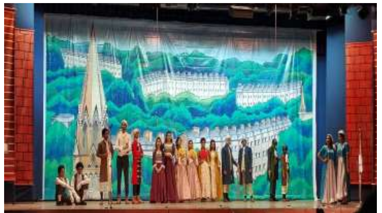
THE RIVALS – Senior School