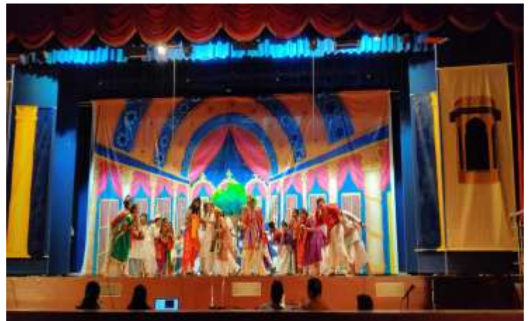
ANDHER NAGARI CHAUPAT RAJA – Middle School

For the first time the students were being selected for the choir which was put up by the Primary section students