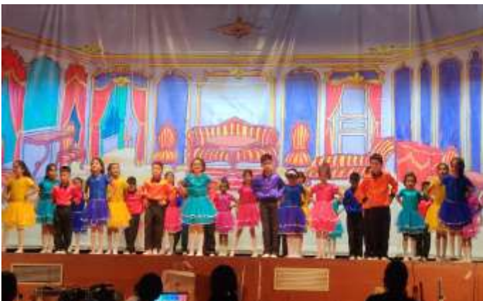
OLIVER TWIST – Primary School