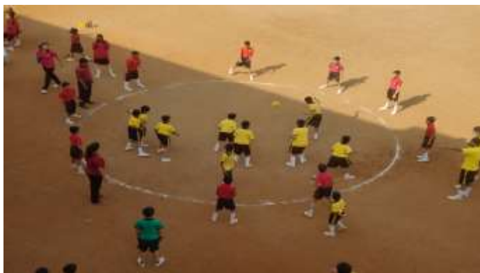
Sub Junior Dodgeball Boys Dedication Sub Junior Dodgeball Girls Discipline

Both these competitions had the four groups i.e. Sub- juniors, Juniors, Middle and Senior school girls and boys competing for their respective houses. The hot summer did not bring down the ‘josh’ of these players, as they were all into it after a long gap.