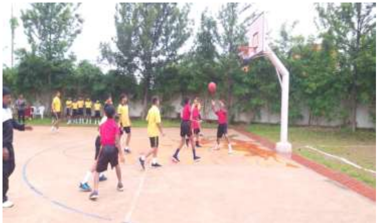
Table Tennis Junior Boys Discipline Table Tennis Junior Girls Discipline Table Tennis Middle Boys Team Spirit Basketball Middle Girls Integrity Basketball Junior Boys Discipline Basketball Senior Boys Integrity Basketball Senior Girls Integrity

The results of inter-house throwball and basketball competitions are as follows: